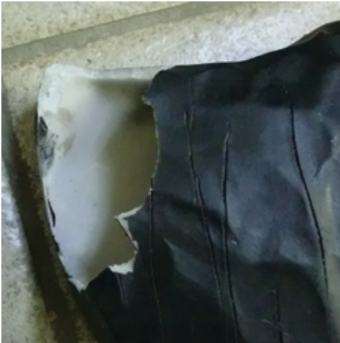
Prep the area requiring repair by removing any debris. Ensure the surface area is clean.

What you'll need: Rubber gloves, Fountain & Statue Repair Putty AD49340, Utility Knife, Paint