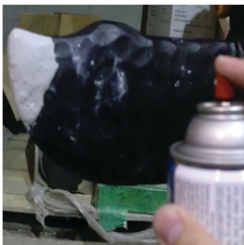
Choose a spray paint that matches the finish of your piece. We recommend paints intended for plastic or concrete applications. Hobby paints are also great for these types of repairs.