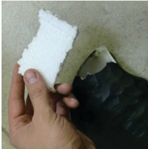
For larger repairs, Styrofoam or a similar material can be used to fill any large voids.