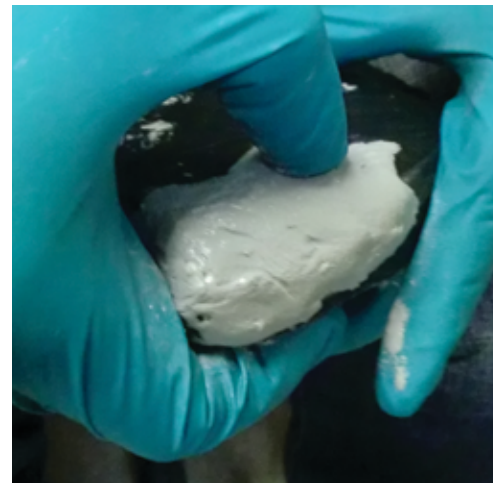
Carefully apply the putty to the affected area. A cloth or other material can be used if needed to add texture to the putty as it dries.