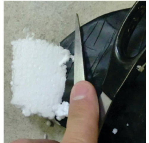
Carefully trim away any excess material with a knife or scissors.