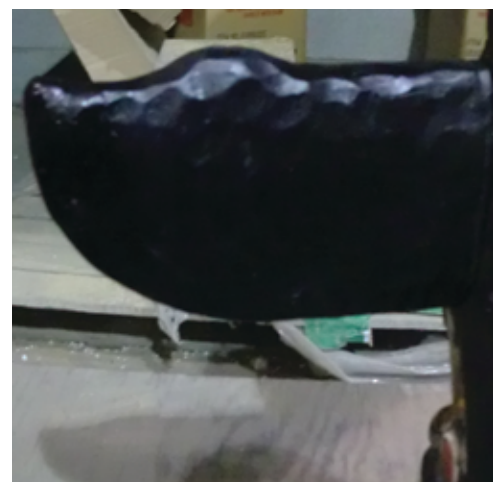
Allow the paint to dry. Add any finishing touches as needed. Multi-colour textured paints often work the best for touch-ups, as they blend well.