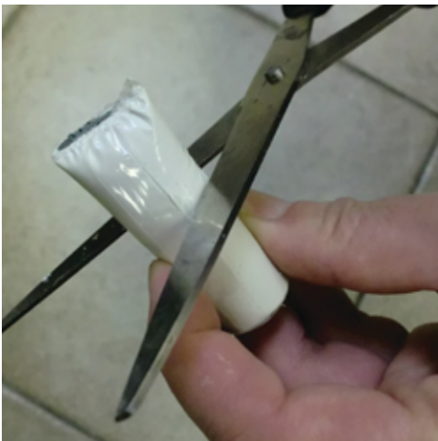
Cut a section of repair putty. It's best to work in small sections at a time.